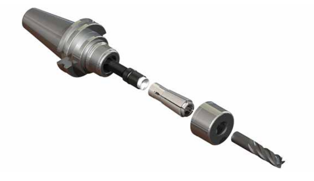
Coolant-Thru Disc: A perfect seal is formed between the nut and the coolant-thru disk. Ideal for coolant-thru tools.